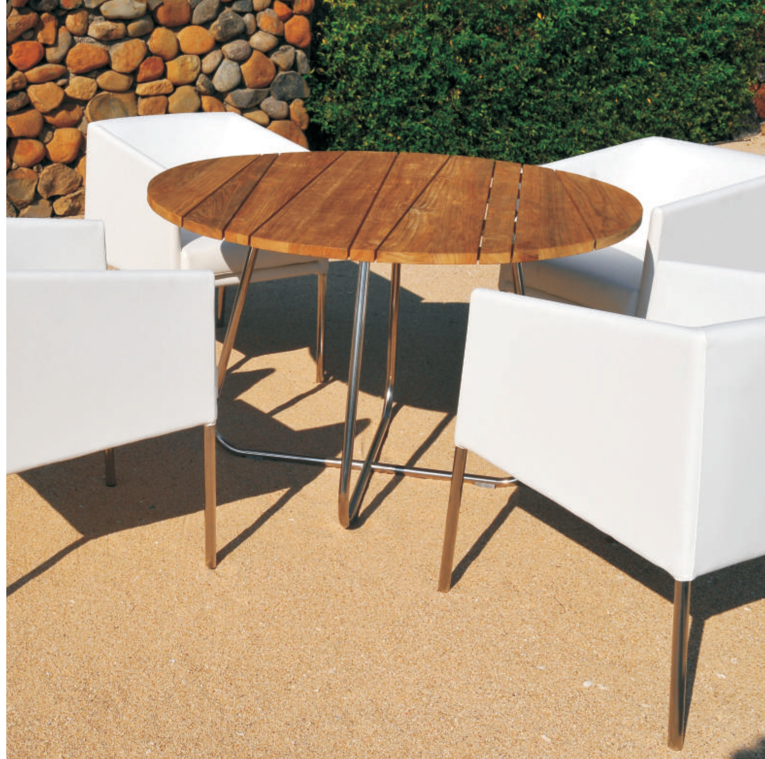
MG 5053 PINO club casual chair (stamskin) MG 3113 GEMMY casual table Ø 120 cm