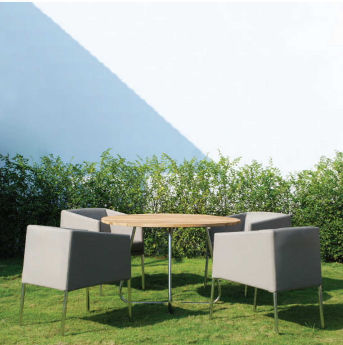
MG 5057 PINO club dining chair (sumbrella), MG 3110 GEMMY dining table Ø 120 cm