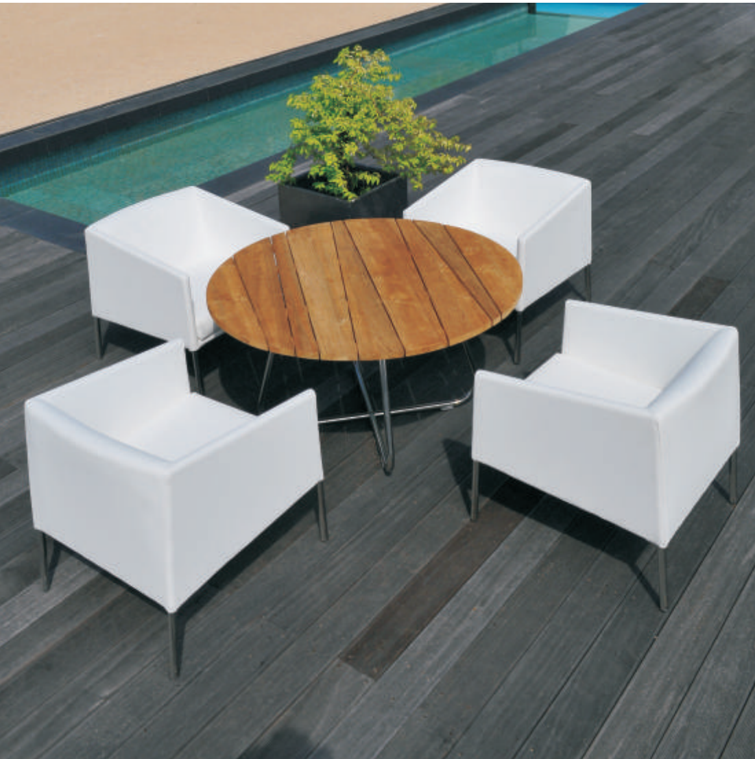
MG 5053 PINO Club casual chair (stamskin), MG 3113 GEMMY casual table Ø 120 cm